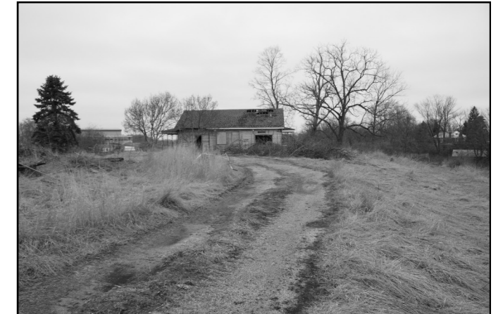
Looking North toward the new building site.