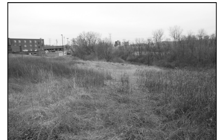
Looking South from the new building site.