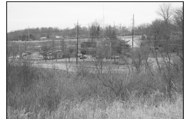
View of the present city building and grounds.