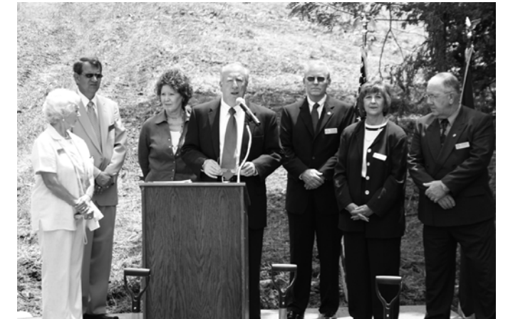
Mayor & Council at Ground Breaking