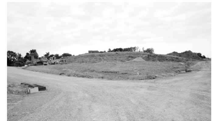
Construction site as of July 2009

This picture of the current work area shows that we have time to look into what we as a city can do to accommodate these requests. Future newsletters will address this issue in more detail.