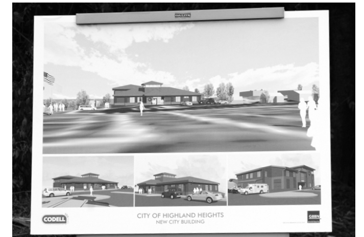
Artist Concept of New City Building